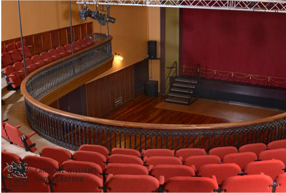
Stephenson Transport Auditorium (Large Venue)