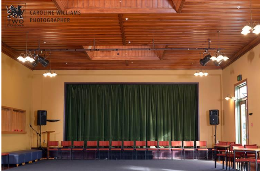
Gwen Malden Concert Chambers (Smaller Venue)